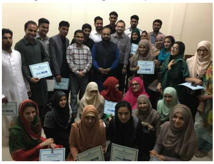
Disaster Management Training, 24 March, 2017, University of Kotli AJK.

KIIR believes that it is essential to equip local communities with knowledge and skills, to handle conflict-based crises and natural disasters. During the past twenty-five years, this component of KIIR's program has initiated a wide spectrum of activities starting with disaster preparedness and mitigation, and moving on to response in disaster-