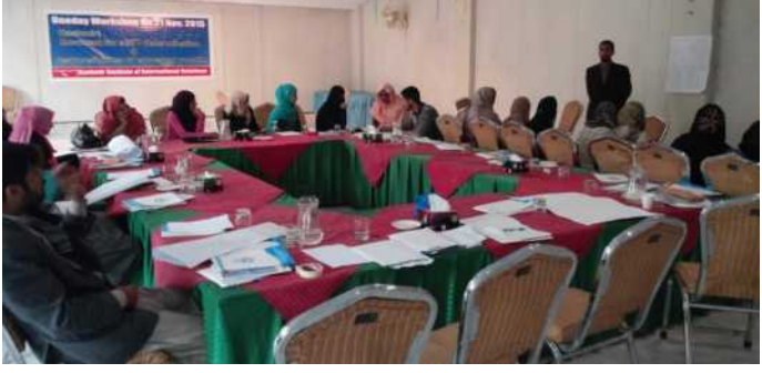
Oneday Workshop with Kashmiri Youth on 21 Nov. 2015

A large population of these migrants are young people. Scars of a troubled past are visible on those young men and women who migrated from Indian-held Kashmir after 1989 or were born in families who migrated in that period. Since they are recently divided from their families, the sense of deprivation and grief is more intense within them. Human rights abuses in Indian-occupied Kashmir and denial to a way forward for a peaceful resolution of the Kashmir issue has aggravated their frustration. Young women and men from migrated communities are particularly affected by multiple challenges at all levels. In order to mitigate the challenges KIIR has been working with young women and men who grew up in refugee camps for many years. The series of consultative workshops in previous years provided spaces for dialogue on ways for peaceful conflict resolution, peace building, human rights and advocacy. The major focus was skill building of potential youth and their involvement in advocacy of human right abuses with