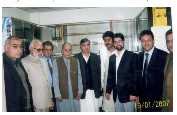
Hurriyat Leaders visit to KIIR on 19 Jan, 2007

From facilitating dialogues on educational curriculum to generating platforms for a stronger Kashmiri voice, KIIR brought diverse opinions forward to influence perspectives.