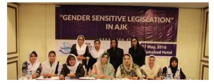
"Gender Sensitive Legislation in AJK" workshop, 27th May, 2016 at Islamabad