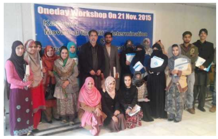
Oneday Workshop with Kashmiri Youth on 21 Nov, 2015

the Kashmiris by the authorities especially in IoK. This methodology mobilized the youth towards peaceful means rather than adopting violent behaviours. Now there are many youth in AJK who are pro-active agents of peace in their communities, in their schools and work places.