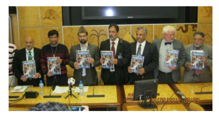
Report Launch at UN Geneva on 18th Sep, 2012