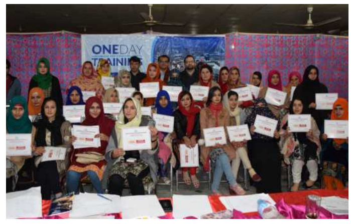
Disaster Management Training, 3 March, 2018, Bagh AJK

volunteers, when a crisis hits. Availability of trained youth in disaster response techniques have enhances resilience among communities for disaster response. It has created safer neighbourhoods and increased sense of ownership among members of the community by generating discourse on local vulnerable groups and structures.