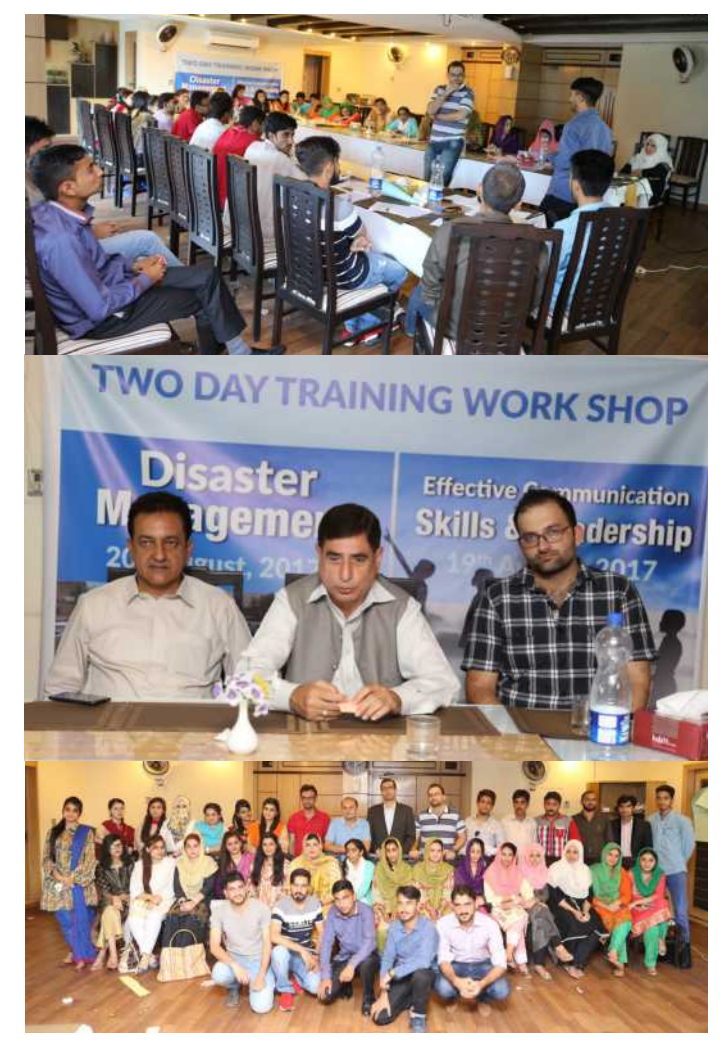
Disaster Management Training Islamabad, 19 & 20th August, 2017

The primary beneficiaries of this program are youth of AJK, particularly those studying in universities. It has been observed that youth in AJK lack knowledge, skills and platforms to act as first response in any type of disaster. Therefore, KIIR is making efforts to develop a cadre of equipped and motivated men and women that can quickly join hands with local disaster response mechanisms as