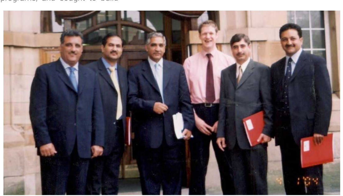
KIIR Delegation Visit to Northern Ireland 2004

Washington DC, International Centre for Religion and Diplomacy, Washington, DC, United States Institute for Peace, Centre for Strategic and International Studies-Washington DC, Henry L Stimson Centre- Washington, DC, Muslim Judicial Council- South Africa, Human Rights Foundation- South Africa, and the Institute of Culture and Languages- Vienna.