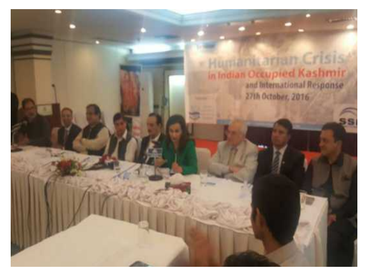
Workshop on Humanitarian Crisis & International Response on 27th Oct, 2016 at Islamabad Hotel

institutions, government departments, NGOs and cultural groups. The trust and confidence of local communities and institutions is a precious asset for KIIR that it had earned through sheer commitment and focus on peace objectives.