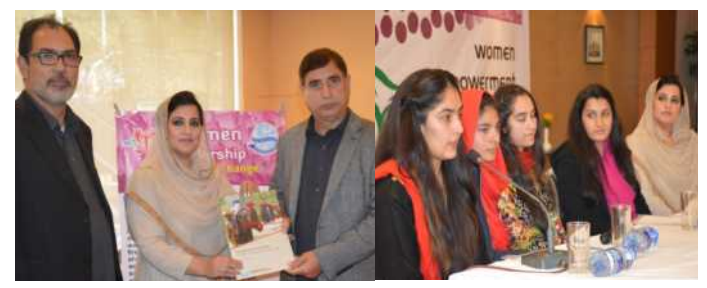
Celebrating 5-Years of Women Empowerment Initiatives by KIIR", 22 December, 2017 at IslamabadClub-Islamabad

Since 2013, KIIR has been engaging and bringing together women from across all divisions of AJK (Mirpur, Muzaffarabad, Rawalakot). Through various capacity building workshops, leadership and conflict resolution trainings, and policy dialogues, KIIR has supported a large constituency of AJK women in articulating their voices and claiming spaces for themselves in the existing civic platforms. KIIR has enabled them to think creatively and claim their lost spaces and see their larger role in resolution of the conflict, of which they are the biggest victim. This is done through creating an environment for collaborative learning by setting a tradition of reaching out to communities which are voiceless or unheard in the Kashmir conflict including women suffering directly from shelling at the Line of Control (LoC), and women who want their narratives to be heard and feed into policy making processes relating to the conflict.