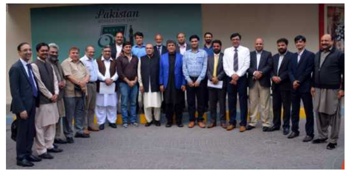
Media conference 26 -27 March, 2017 at Falaties Hotel, Lahore

An efficient, well-resourced media is crucial for safeguarding of peace. While there is increasing recognition of media and its positive and negative potential in relation to Kashmir conflict, there is relatively little accessible evidence on what works, guidance for journalists, or attention from policy makers.