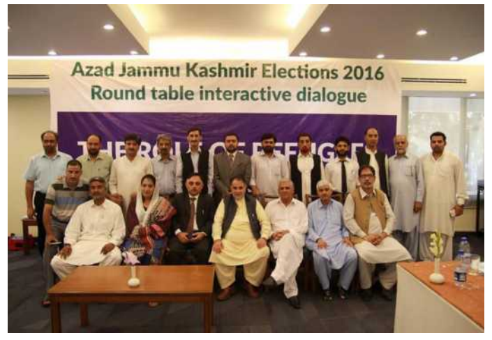
AJK Elections 2016 Round table interactive dialogue 5 June 2016

Over the years, KIIR has arranged several training programs for political leaders and parliamentarian of Azad Jammu and Kashmir in Washington DC engaging different think tanks and experts. KIIR arranged study tours of AJK civil society to Northern Ireland and South Africa to study the reconciliation processes there. In 2007 KIIR organised a two days conference in collaboration with Institute of strategic studies Islamabad (ISSI) which was attended by the representatives of world renowned think tanks and institutions. In order to bridge the gap between political leaders of Azad Kashmir and Indian occupied Kashmir, KIIR also arranged the first Kashmir Leadership Conference in 2008.