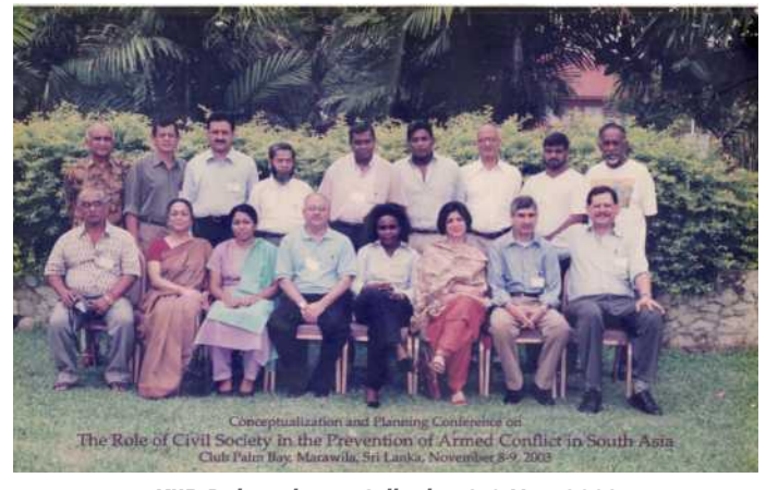
KIIR Delegation to Srilanka, 8-9 Nov, 2003

informing policy—makers about perspectives of Kashmiri communities, KIIR tried to address a key gap. This has resulted in greater openness of decision-makers, sociopolitical leaders and academics for engagement with indigenous Kashmiri perspectives. KIIR reached out to almost every tier of political and social spectrum in Azad