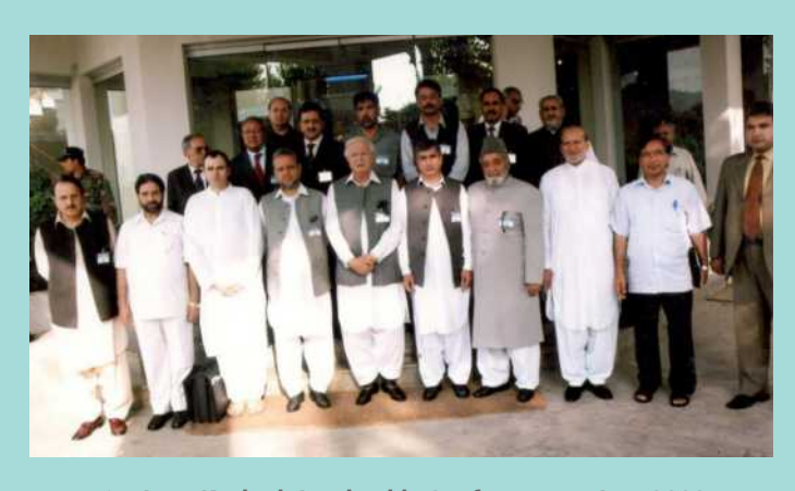
1st Intra Kashmir Leadership Conference on Aug, 2008