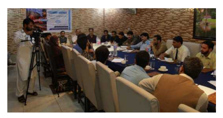
Capacity Building Workshop of Refugees on 27 August, 2016

KIIR believes that young people, as members of a dynamic group, can play a crucial role in positively transforming conflict situations and in building the foundations of democratic and peaceful society. Displacements across the Line of Control (LoC) have been a permanent issue since 1947. There were several waves of migrations in 1947, 1965 and then after 1989 which is continuing until today. According to AJK government figures, there are around 15,000 families (45000+ people) of migrants, majority of which are living in camps established by the government of AJK in Muzaffarabad, Poonch and Mirpur divisions. Government of Pakistan, Azad Jammu and Kashmir are taking care of these camps. Governments of AJK and Pakistan and some non-governmental organisations are contributing to their wellbeing.