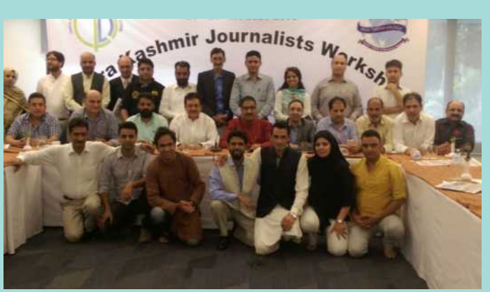
Intra Kashmir Media Conference 23-24 Jan, 2018