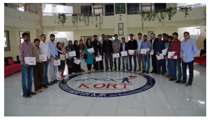
Disaster Management Training, 11 March, 2018, Mirpur AJK

The component has particularly benefited education institutions in AJK where youth-groups have been mobilized to vigilantly look at local demographic, political and environmental conditions; and prepare plans for disaster response. Such initiatives have promoted an atmosphere of healthy activities in education institutions by providing the students with opportunities to learn and employ new skills.