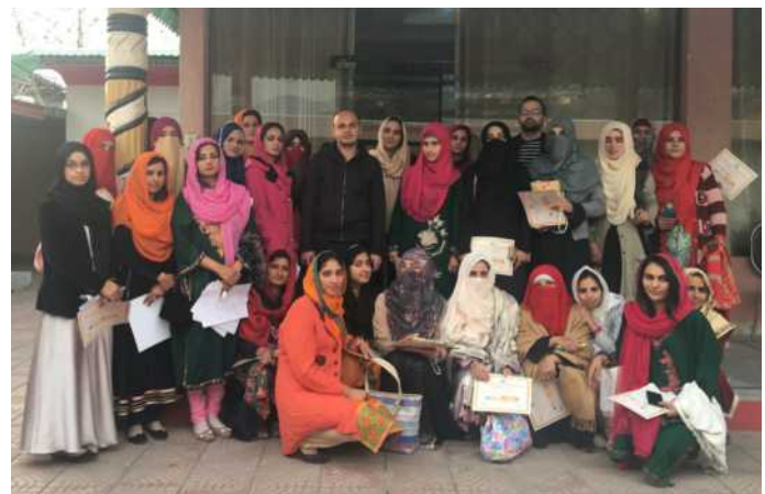
Disaster Management Training, 9 December, 2017, Bagh AJK

The primary beneficiaries of this program are youth of AJK, particularly those studying in universities. It has been observed that youth in AJK lack knowledge, skills and platforms to act as first response in any type of disaster. Therefore, KIIR is making efforts to develop a cadre of equipped and motivated men and women that can quickly join hands with local disaster response mechanisms as