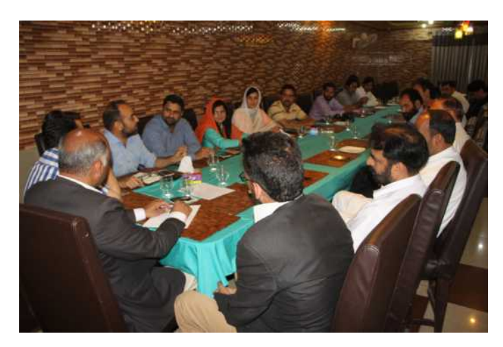
Journalist Workshop at Muzaffarabad, April, 2018

organization is empowering journalists to present the true picture of ground realities Likewise, KIIR is facilitating media to disseminate reliable information about Kashmir conflict; and represent a range of views sufficient for communities in this region to make well-informed choices.