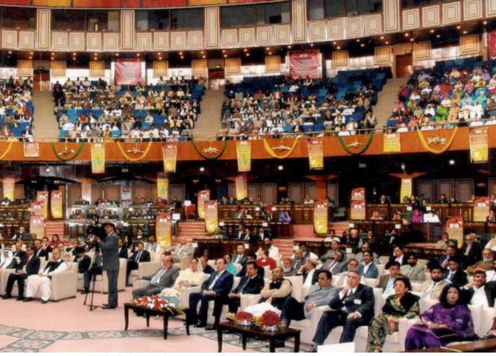
International Kashmir Conference Organized by Institute of Strategic Studies & KIIR, March 16-17, 2007