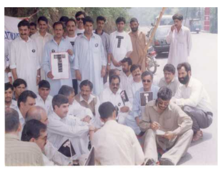
Sit-in on International Torture Day 1999 at Muzaffarabad

Human rights advocacy is the cornerstone of KIIR's work for peace building and giving voice to the voiceless. The Human Rights Desk at KIIR regularly monitors, documents and disseminates information about incidents of human rights violation in Indian occupied Kashmir to the United Nations Special Rapporteur, United Nations Human Rights Council, and Office of the High commissioner on Human Rights, global think tanks, human rights watchdogs and other stakeholders. Since 2005, KIIR has been regularly publishing yearly and quarterly reports, pamphlets, and handbills on human rights violations which are widely circulated and appreciated at national and International level. KIIR delegation regularly attends sessions of Human Rights Council in Geneva and has developed a close liaison with UN agencies.