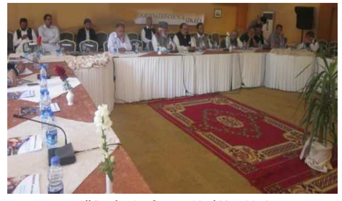
All Parties Conference 22nd May, 2014

For greater awareness, KIIR organized workshops and training programs for young political leaders in AJK. Efforts were made to create consensus on issues of significance, with reference to the Kashmir conflict. A landmark conference was organized in Dubai in 2017 that brought together all political parties in pursuit of finding viable solutions to the simmering conflict and express their feeling on the human rights situation of Indian occupied Kashmir.