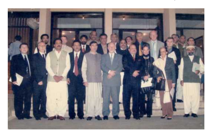
Foreign diplomats hosted by KIIR

Over the years, KIIR has mobilized hundreds of leaders and thousands of peace activists by providing them training, information and linkages. This has enhanced the prospects for lasting peace in Kashmir through inclusion of Kashmiri voices in the peace process as well as transforming relationships across various communities. Initiatives like 'Kashmir Conflict Transformation Workshops' were