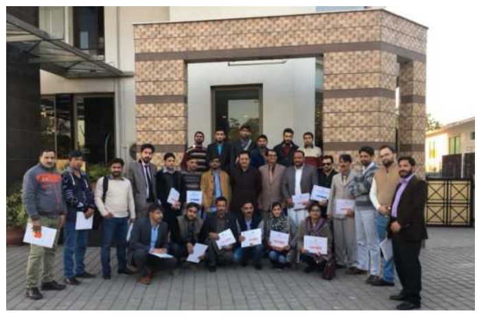
Journalist Workshop at Regency Hotel, 2018

Building upon this success, a major development was formation of joint platforms for journalists in the Kashmir region. The objective was to share news, conflict-related reports and concerns about journalist's safety. Creation of 'Jammu and Kashmir Joint Media Forum' in 2018 opened doors for greater interaction between journalists working in all parts of Kashmir.