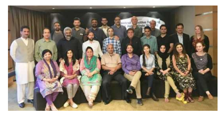
Intra Kashmir Media Conference 22-23 March, 2018

KIIR has built upon various social and cultural traditions to promote harmony at the grassroots level. In this way, KIIR laid the foundation for creating a more diverse, more sustainable culture of dialogue. KIIR's approach was to develop a cadre of next-generation Kashmiri leaders who are committed to transform the political, social and spiritual dynamics of the region and build momentum for peace on an incremental basis.