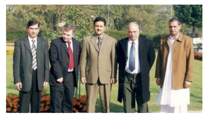
Kashmiri delegation with I.W. Jones, Wales Assembly, 3 January, 2005

KIIR has strengthened youth groups, promoted women's dialogue processes, increased skills of media professionals, deepened ties between business groups as well as new target groups, particularly those involved in rehabilitation of displaced families and communities affected by various forms of crisis.