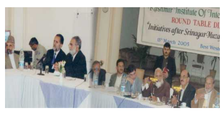
AJK Leadership Conference 13 March 2005 Islamabad