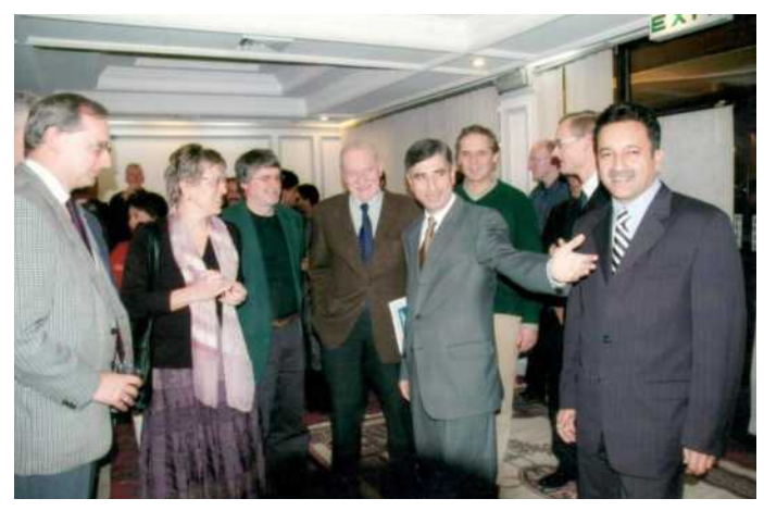
Meeting with diplomats after earthquake 2005

successful in providing spaces to participants for sharing of ideas and experiences. KIIR believes that such interactions are needed in order to build an environment of sustainable dialogue among Kashmiri people for strengthening the ongoing efforts for peace in South Asia. It is important to remind ourselves that the Kashmir dispute should be resolved in-line with the aspirations of Kashmiri people by extending their right to self-determination.