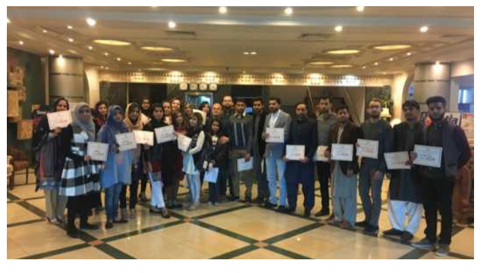
Disaster Management Training 2ndDecember 2017, Mirpur AJK

KIIR is working with local disaster management institutions (SERRA and others) and education institutions by establishing partnerships and engaging youth groups. The program has enhanced transfer of DRR knowledge among professionals and academics. Such collaborations have enhanced exchange of knowledge, resources and ideas. Because of KIIR efforts, many partnerships have been formed between academic institutions, government departments and communities, thus creating new and successful models of Public-Private-Partnerships in the discipline of DRR.