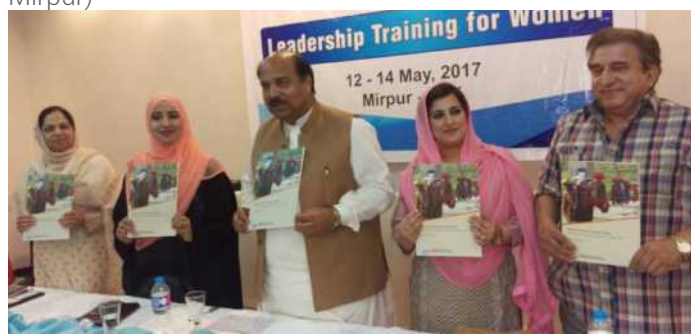
Report Launch "Voices Unheard, Stories Untold: The Plight of Women in Neelum Valley - AJK, May, 2017 at Mirpur

2017-18: 4 Leadership and conflict Resolution trainings, for young women (Islamabad, Rawlakot, Muzaffarabad, Mirpur)