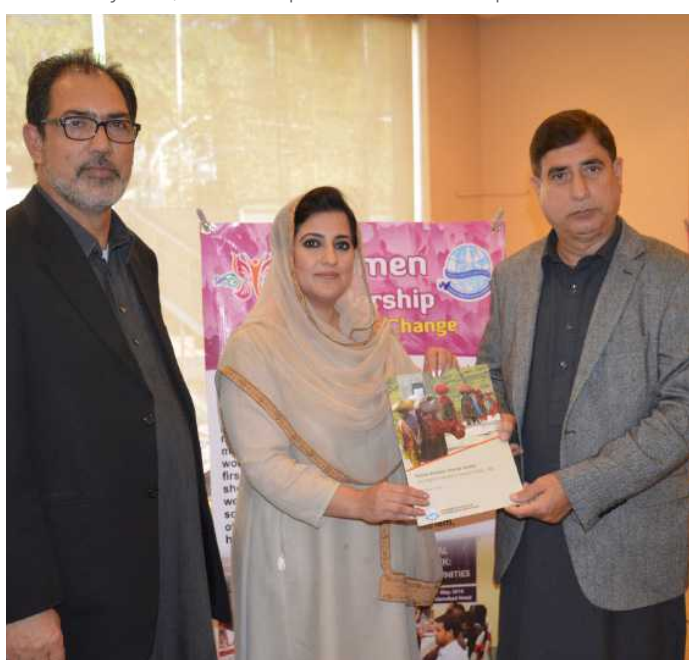
Report launch Impact of Conflict on women living on LOC, Dec 2017

It is a challenge to find objective, fresh, and researchbased knowledge resources and insights about impact of conflict on the lives of people living in Kashmir, particularly women. KIIR is filling this need with new data and analysis to highlight aspects of situation that are often overlooked. Over the years, KIIR has produced several publications and